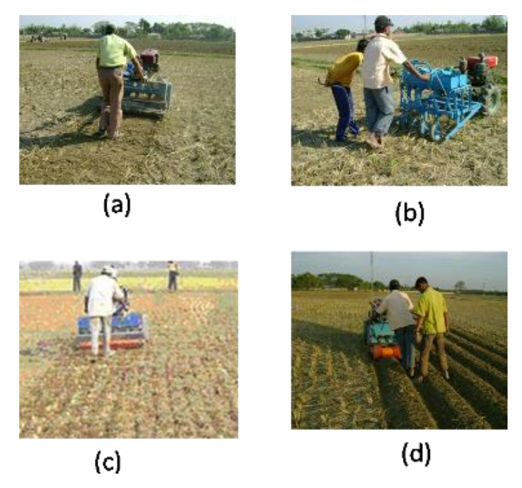
Figure 2. Two Wheeled Tractor Operated seeder (PTOS) in Bangladesh; planting six rows in no-tilled field in full-width tillage mode (a), No-till tined drill planting rabi crop (b), strip-till planting crop (c), forming raised bed and planting simultaneously in no-tilled field (d).