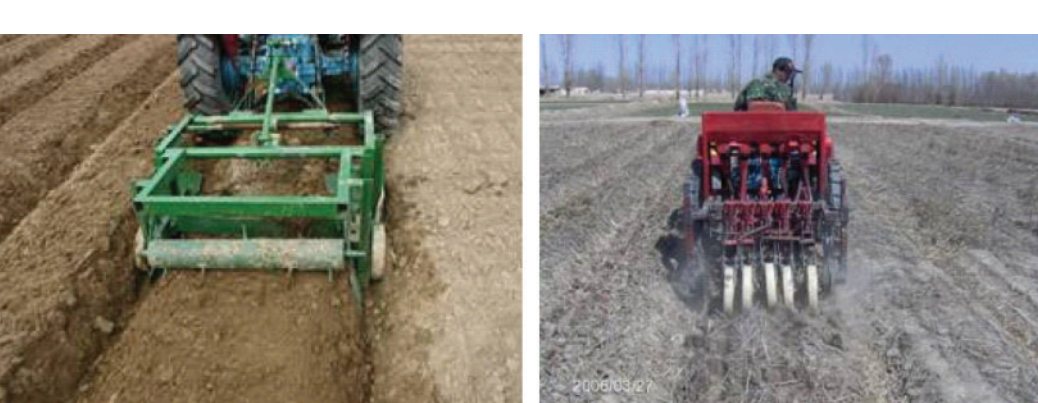
Fig. 1. Mouldboard bed former (left) and no-tillage planter (right).

Soil volumetric water content to a depth of 0.30 m for each treatment is illustrated in Fig. 2 for the wheat growing periods from 2005 to 2007. In all cases, soil moisture gradually decreased with crop water use during the growing period. At the beginning of the experiment (March, 2005), soil water content in the top 0.30 m depth in the PRB treatment was about 18%, and significantly (P < 0.05) less than in TT probably due to moisture losses during bed-forming. However, the PRB treatment still had the greatest soil water